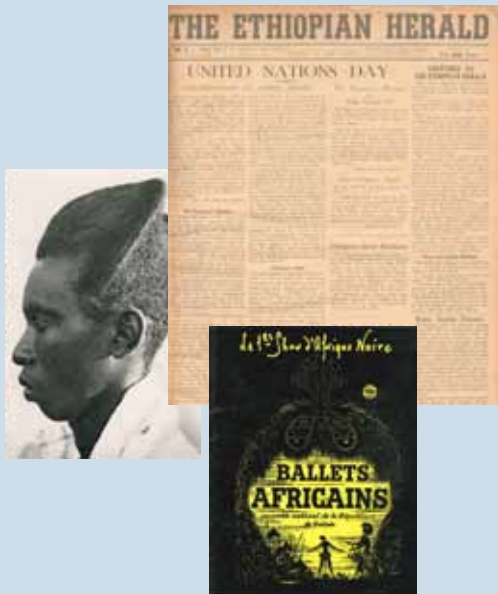
CLOCKWISE FROM TOP: first English language newspaper in Ethiopia. Founded by Sylvia Pankhurst upon the departure of the Italian occupation government. From the Yale African Collection; Program from first European performance of acclaimed Guinean dance troupe. Photo: Nels @1920, "Young Mututsi, Ruanda-Urundi", from the historical African postcard collection.