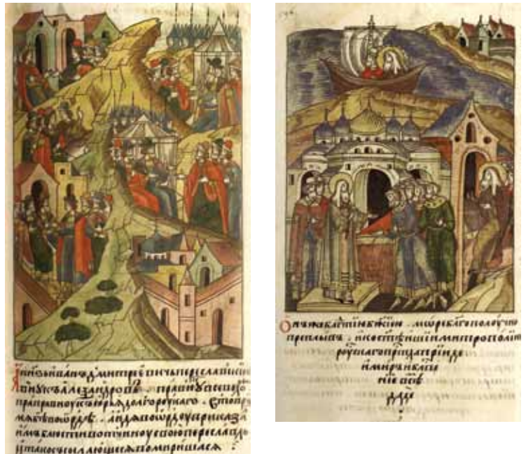
Image taken from Litsevoi Letopisnyi Svod XVI Veka: Russkaia Letopisnaia Istoriia, one of the Slavic collection's major acquisitions this year.

It is the need to preserve and to provide access to irreplaceable collections such as these that makes us impatient with the pace of advancements in digital preservation and requires us to take a leadership role. Similarly, with more than half of our collections published outside of the U.S., we recognize that the Yale Library must take the lead in the research and development of discovery and access tools for non-English library resources.