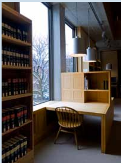
Yale Center for British Art reading room carrel.

Sir David Willcocks Oral History Collection. A interview collection on choral conductor and composer Sir David Willcocks.