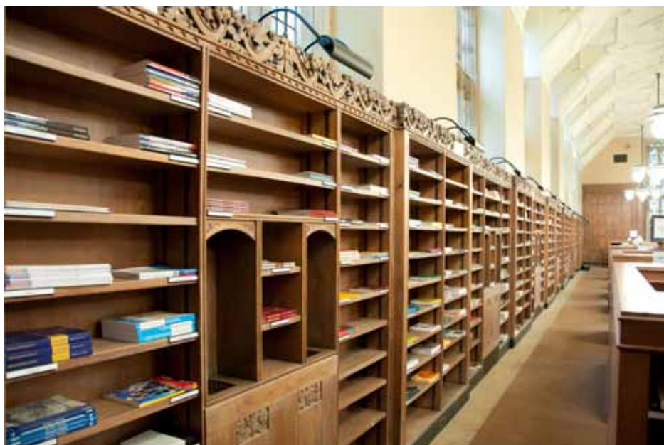
Improved management of the collection in the Franke Periodical Reading room, including new signage and documentation, promotes better access to the Library's print periodicals.

The three-year project to catalog endangered African languages, generously supported by the Arcadia Fund and individual donor funds, was completed with significant results. Catalog records for materials in hundreds of languages were produced, including at least