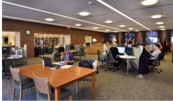
Study Room West in CSSSI —a very popular study space where it can be hard to find a seat. The new center, located atop Science Hill, is a collaboration between the University Library and ITS, and incorporates the services and facilities of the Science Library, the Social Science Library, and the ITS StatLab. Learn more: http://csssi.yale.edu/.

The Yale community is also drawn to our renovated and reconceptualized library buildings. In January, the Center for Science and Social Science Information