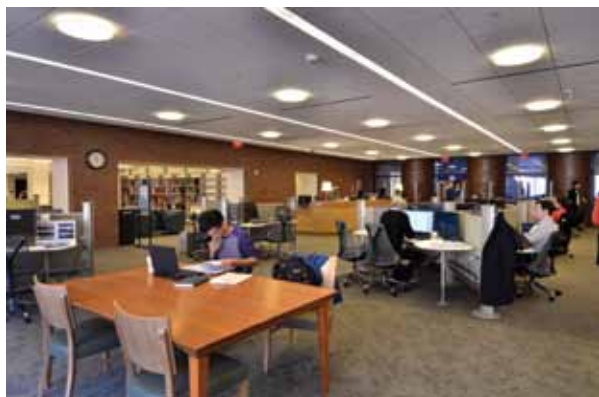
LEFT: Study Room West in CSSSI—a very popular study space where it can be hard to find a seat. The new center, located atop Science Hill, is a collaboration between the University Library and ITS, and incorporates the services and facilities of the Science Library, the Social Science Library, and the ITS StatLab. Learn more: http://csssi.yale.edu/.