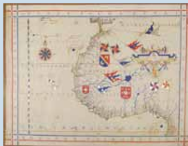
Moleiro facsimile of folio 3 of the Fernão Vaz Dourado Atlas Universal , 1571.