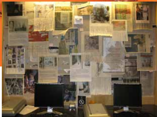
RIGHT: Anamnesis: 9/11 Postings. Installation created by Robbin Ami Silverberg for the exhibition "The Book as Memorial: Book Artists Respond to and Remember 9/11" September 6 – December 16, 2011