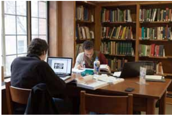
Students in the Medical Library working with both print and online resources.

Our efforts as a digital library are not limited to acquiring and providing access to electronic resources; we are also actively engaged in the digitization of our own unique collections to be shared freely with the world. Yale's Medical Library has scanned and contributed more than 1.7 million pages to the Medical Heritage Library, a free and globally accessible digital library