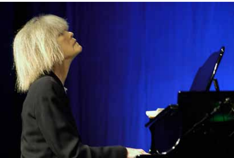
Carla Bley, composer and pianist, was interviewed this year by Oral History of American Music staff.

of new master classes, and some new one-day classes, were held and opened up to constituencies beyond Yale, including topics such as graphic satire and caricature. The Library presented its eighteenth Lewis Walpole Library Lecture, “‘Family Life Makes Tories of Us All’: Love and Power in Georgian England,” given by Amanda Vickery (Queen Mary, University of London). The spring exhibition, “‘The God of Our Idolatry’: Garrick and Shakespeare,” was part of the university-wide celebration “Shakespeare at Yale,” and was visited by classes and tours from Yale and beyond. The editors of the Yale Indian Papers Project established collaborative partnerships with representatives from several Connecticut tribes and began planning with the Institute for New England Native American Studies at the University of Massachusetts for similar relationships with Massachusetts tribes.