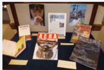
LEFT: The event often called "3.11" in Japan—the devastating tsunami and earthquake of March 11, 2011—was commemorated by a symposium and this exhibit in the East Asia Library.