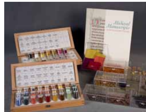
Ink and pigment components of the Traveling Scriptorium, a material culture teaching kit created by the Preservation Department's conservation staff in partnership with Kathryn James, Curator for Early Modern Books and Manuscripts and the Osborn Collection.

is a teaching kit of inks, pigments, binding samples, and paleography resources designed to explain how medieval and early modern books were written, built, and read. The Beinecke Library's Teaching Collection is a set of early modern books intended for travel to classrooms to provide hands-on,