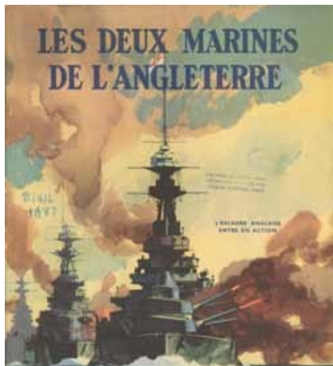
Les Deux marines de l'Angleterre. Publication, London: [Ministry of Information], 1943

work to catalog and inventory portions of the Irving S. Gilmore Music Library's Historical Sound Recordings (HSR) collection housed at Mudd. Approximately 100,000 78-rpm records and 2,700 45-rpm records were inventoried and approximately 58,000 33-rpm records and 7,500 commercial CDs cataloged. An Arcadia Fund project to catalog materials in Iberian languages other than Spanish or Portuguese was completed. The majority of these previously uncataloged materials were in Catalán, followed by Galician (Gallegan), Bable (Asturian), Aragonese, Occitan, and a number of dialects.