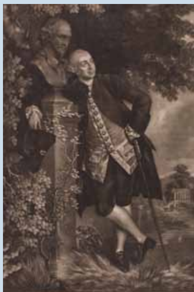
Valentine Green (1739–1813) after Thomas Gainsborough (1727–1788). David Garrick Esq. Mezzotint Published 2 April 1769 by J. Boydell. From the Lewis Walpole Library collection.

Andrés Segovia (1893–1987). Correspondence from the virtuoso Spanish guitarist to French composer André Jolivet (1905–1974).