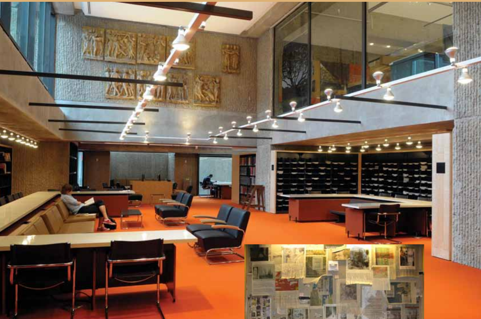
TOP: Study area inside the Robert B. Haas Arts Library.